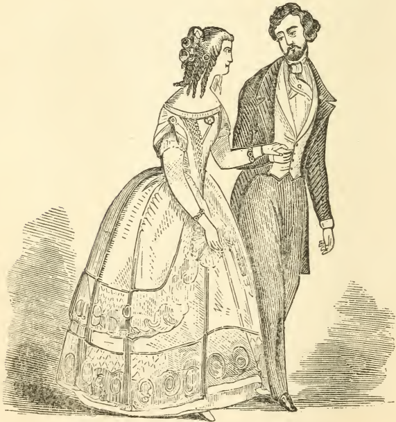
COTILLON CHANGE; FORWARD AND BACK.

And were first danced by four persons standing as the first four now do, in the set ; two more couples were afterwards added and formed the side couples ; thus the English Cotillion and the French Quadrilles are now formed precisely alike, and it is equally proper to call the dance by either name.